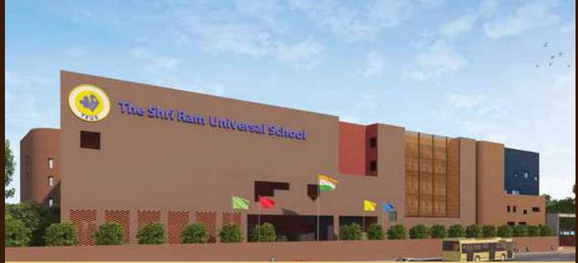
The Shri Ram Universal School - 1300+ Students Enrolled