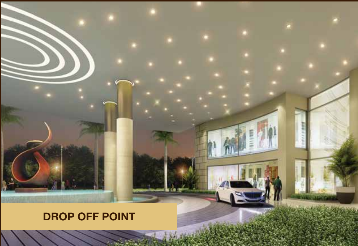
DROP OFF POINT