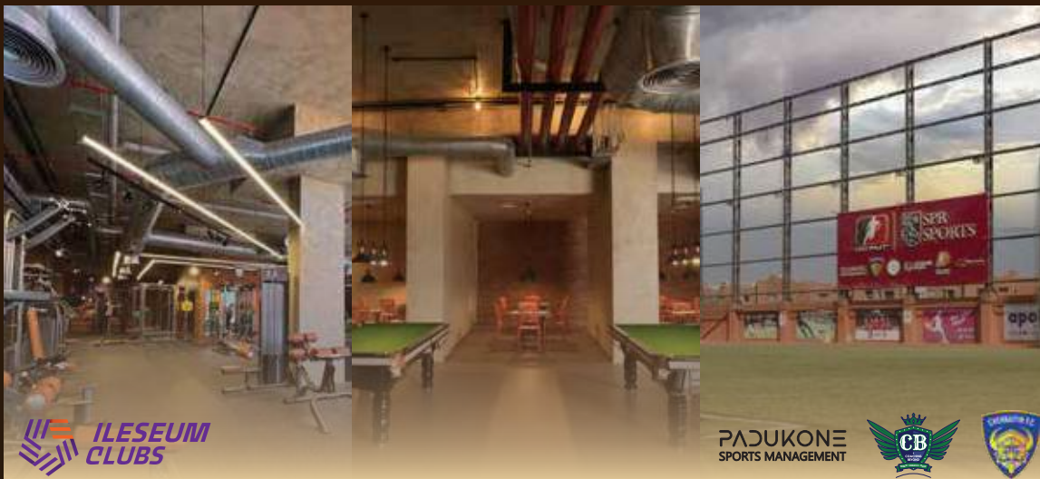
Clubhouse & Amenities