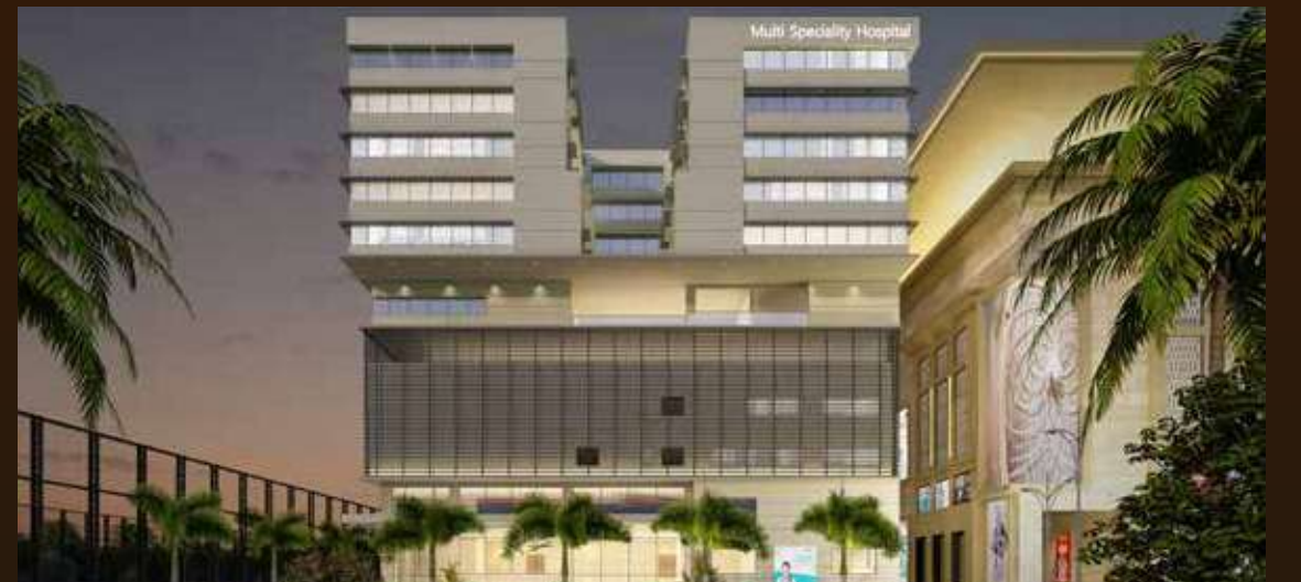
300+ Beds Multi-Specialty Hospital