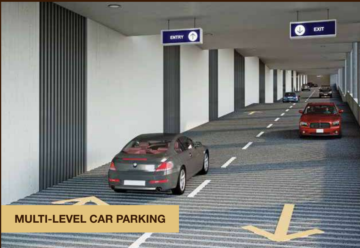
MULTI-LEVEL CAR PARKING