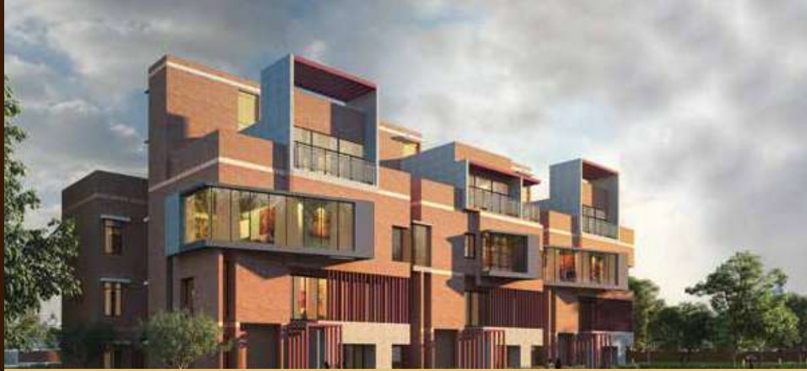
The Madras Bungalows - 85 Bungalows