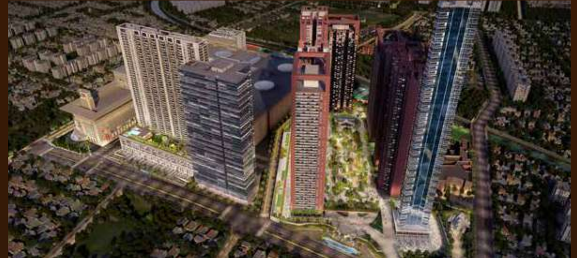
Highliving District & The Capital District - 2500+ Apartments