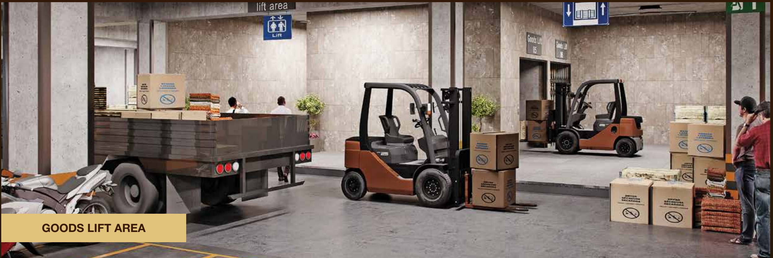
GOODS LIFT AREA