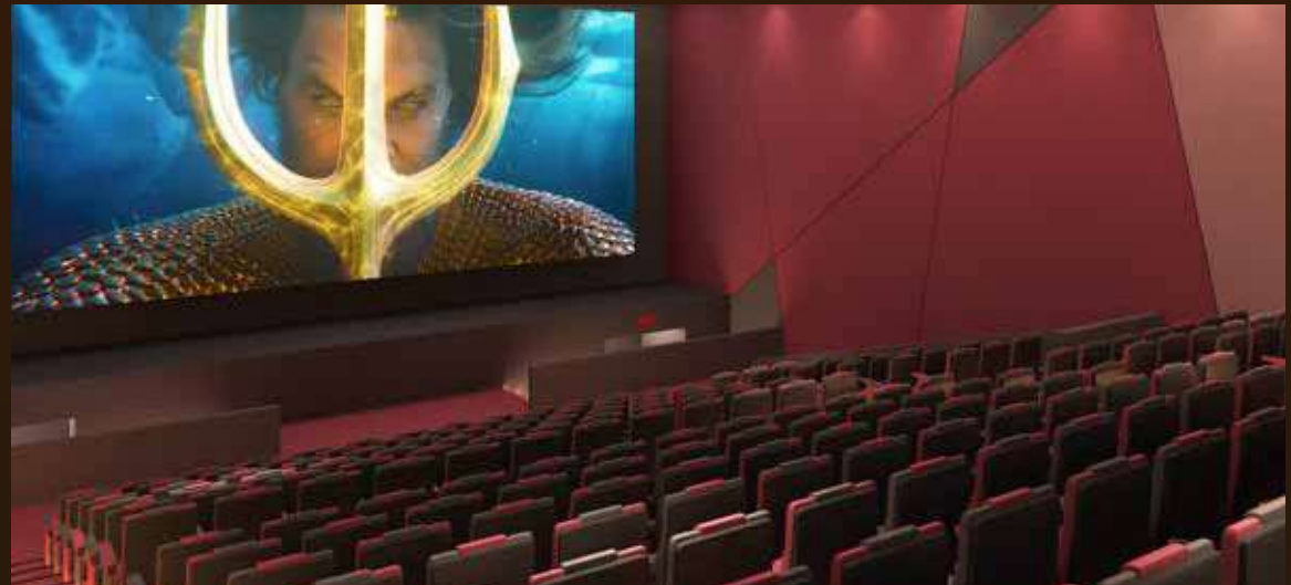
9-Screen PVR Cinemas