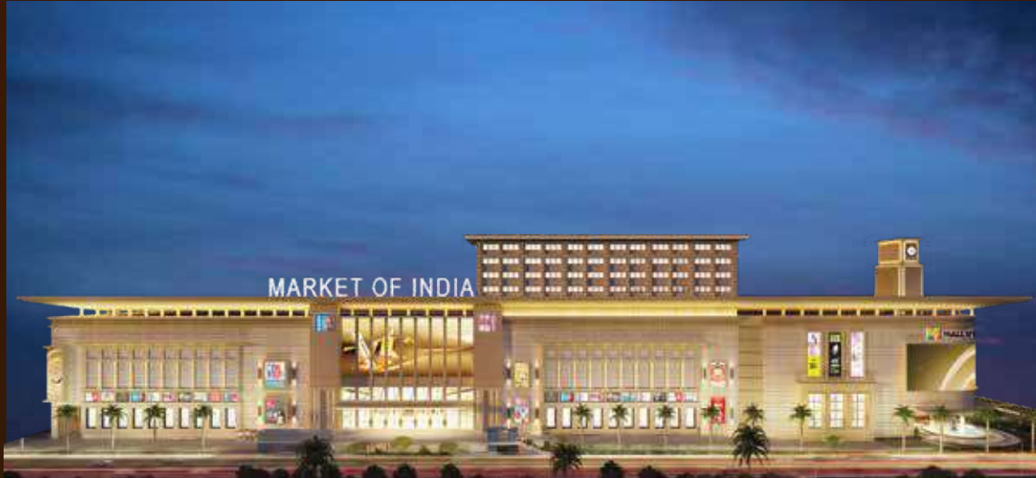
Largest Upcoming Wholesale & Retail Market With 5000+ Shops